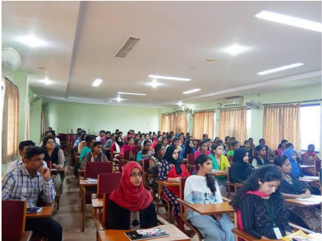
WORKSHOP ON HEALTH AND HYGIENE

(Affiliated to JNTUH, Approved by AICTE and PCI, New Delhi. Accredited by NAAC)